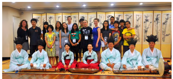
Our 2011 student delegation, joined with their counterparts in Iksan, So. Korea after a private concert of Traditional Korean Music..