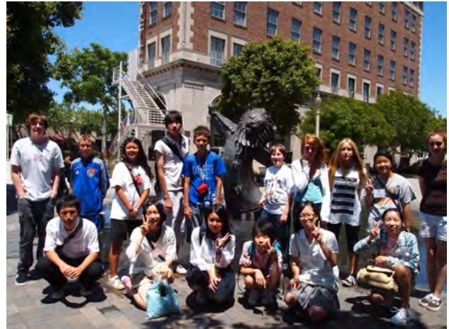
Our Kaizuka & Culver City kids at Culver Plaza 7/11

We will be sending a middle school delegation to Kaizuka next summer, so be sure to stay connected for more information on FACEBOOK.